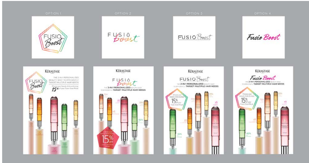
LOGO PROPOSAL DRAFT 1